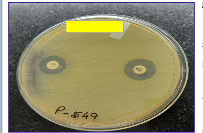
Figure 1: Showing disk diffusion test resulting cefoxitin resistant but oxacillin sensitive zone.

This study found isolates with lower oxacillin MICs but OS-MRSA prevalence was relatively lower. Routine laboratory identification of MRSA by using oxacillin disk may sometimes results in false negative MRSA, which may lead to treatment failure due to inaccurate antimicrobial usage. Hence it is important to use better methods to differentiate OS-MRSA from MRSA by combining phenotypic and genotypic methods.